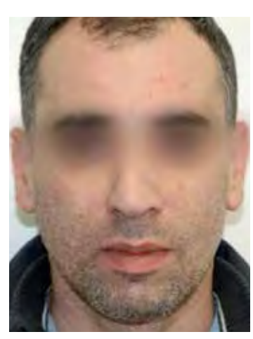
ACNE SCARS, DOWN-TIME EVOLUTION - 7 DAYS - 12 DAYS