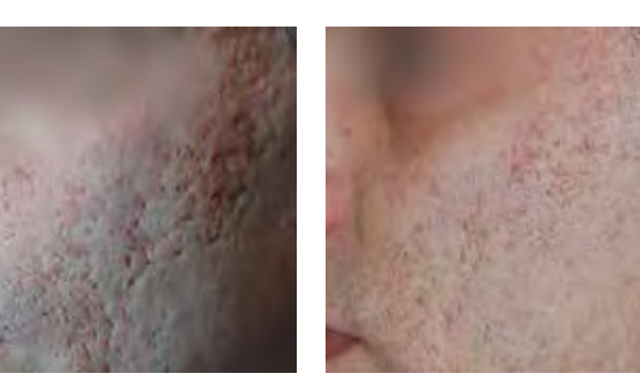
ACNE SCARS