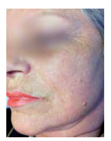
WRINKLES AND SKIN LAXITY, DOWN-TIME EVOLUTION - 5 DAYS - 60 DAYS