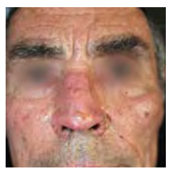
RHINOPHYMA